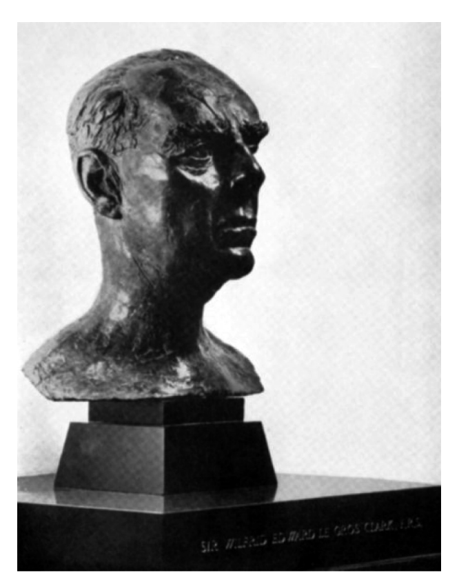
Fig. 2. - Bronze bust of Sir Wilfrid Le Gros Clark by Jacob Epstein in the Le Gros Clark Building, Oxford.

was a member of many foreign societies, including the Norwegian Academy of Art and Sciences, the Royal Society of New Zealand, the American Philosophical Society and the National Academy of Science in Washington.