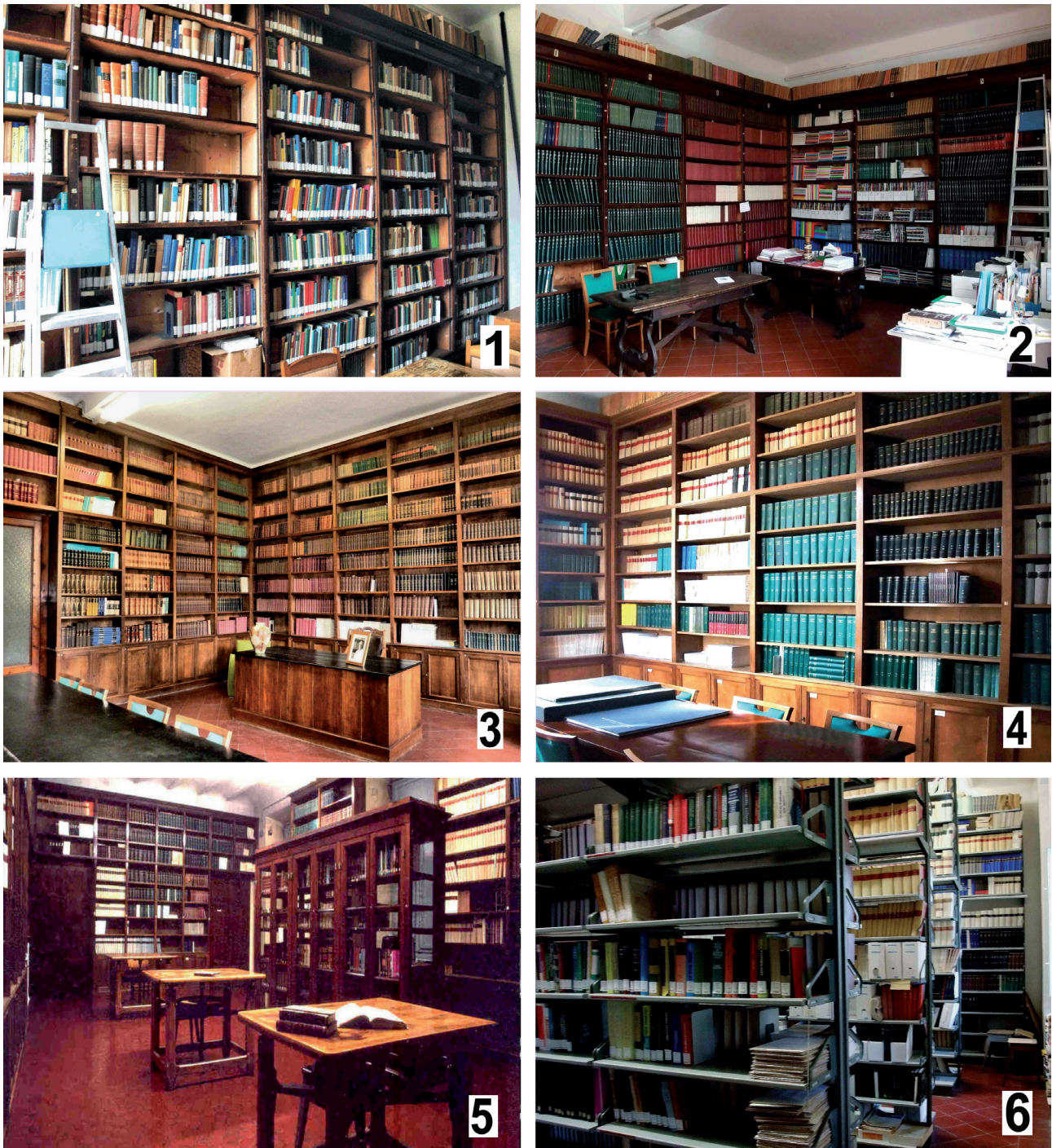
Fig. 3. - The six rooms of the Library at Pisa numbered in accordance with Fig. 2.

to 3.678.550 Italian Liras, and twenty years later, in 1969, it was increased to 60.039.959 Liras, owing to the investments made by the Professor (see Università di Pisa, 1969). As a consequence the space dedicated to the library was increased from