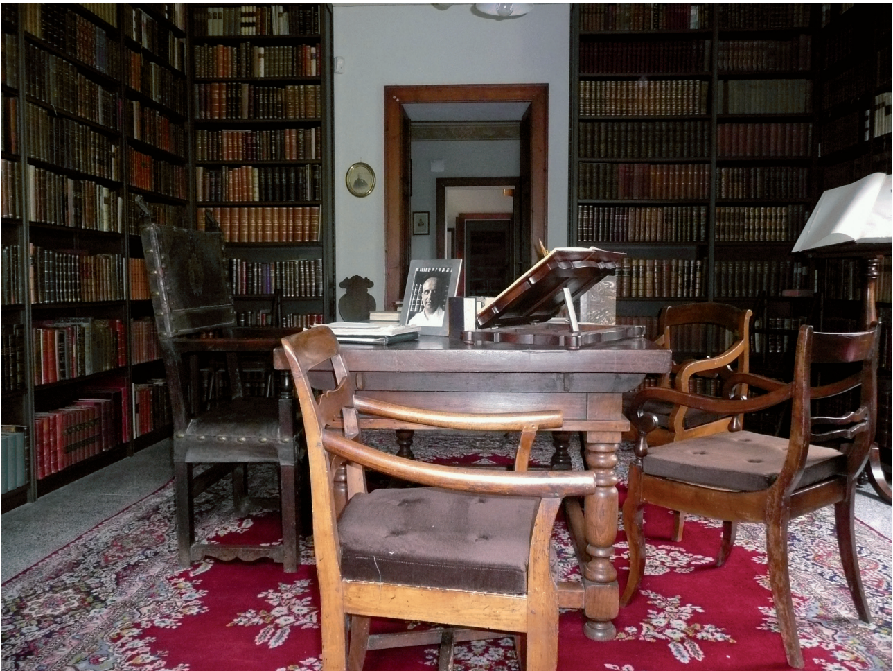
Fig. 1. - A room of Giuseppe Moruzzi's Library in his residence at Bombodolo.

journal subscriptions have ceased, in the hope – which proved to be groundless – that the economic crisis would not last for long.