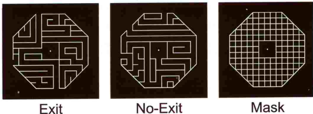
Fig. 1. - Maze stimuli.

A. Examples of maze stimuli including an exit maze with 3 turns in the main path (left), a no-exit maze with 1 turn (middle), and the masking grid (right) presented at the end of the maze display interval.