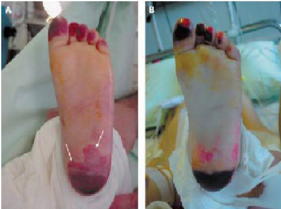
Fig. 3. - A: The ischemic area at the heel, shown by arrows, 48 hours after fasciotomy. B: Evolution of the necrotic area at the heel (pre-escharotomy), with good revascularisation of pre-existing ischemic area after ten days NGF treatment. Ischemic lesions of the toes persist unchanged in size, and formation of bullous lesions can be observed.

Previous experimental and clinical studies have shown that hypoxic-ischemic injury determines an increased expression of NGF and other neurotrophic factors in the nervous system, and that the NGF up-regulation plays a pivotal role in protect-