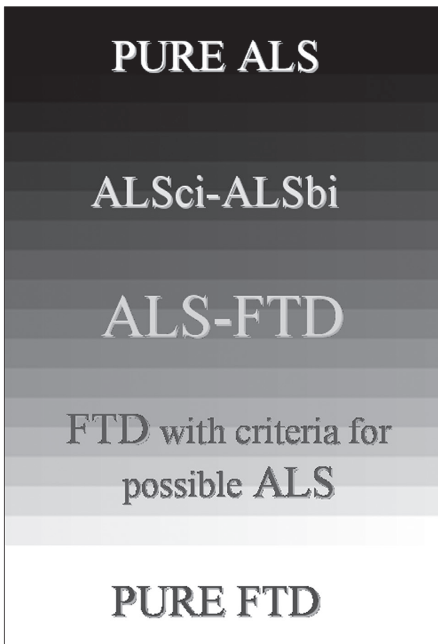
Fig. 1. - ALS and FTD clinical continuum.

mately 14% of patients with FTD developed, over the course of disease, motor alterations and showed instrumental abnormalities on EMG, consistent with the diagnosis of ALS. In addition, about 36% of the patients with FTD show signs of suffering of the first and/or second motor neuron (Lomen-Hoerth et al., 2002). Despite these results no clear reports exist of patients in ALS centers developing clear FTD during the course of motor degeneration (Wolley and Katz, 2008).